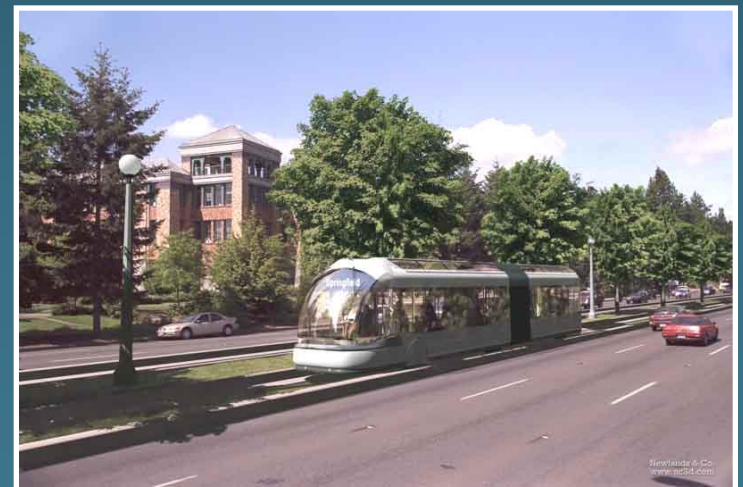
BRT concept bus (Civis by Irisbus) 6 on exclusive busway.