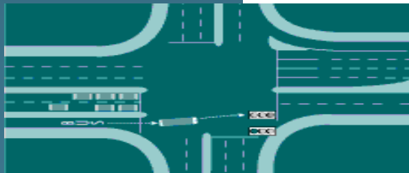
Bus queue jumpers & signal pre-emption.