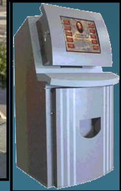
Advanced traveler information systems.