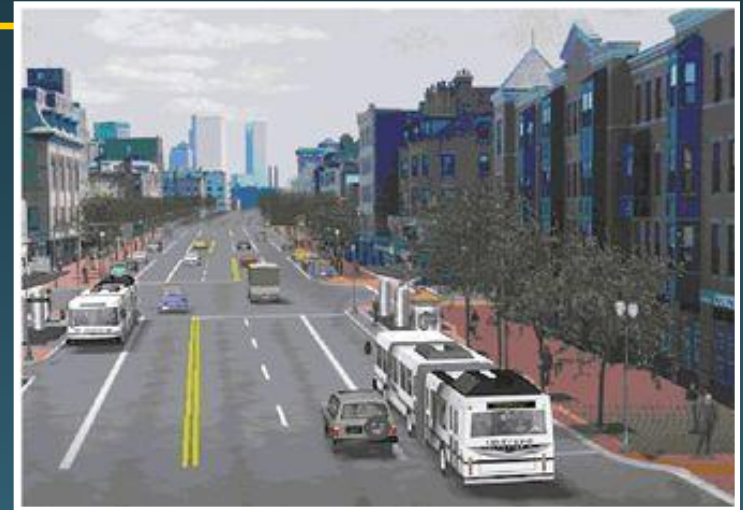
BRT on preferential lane.